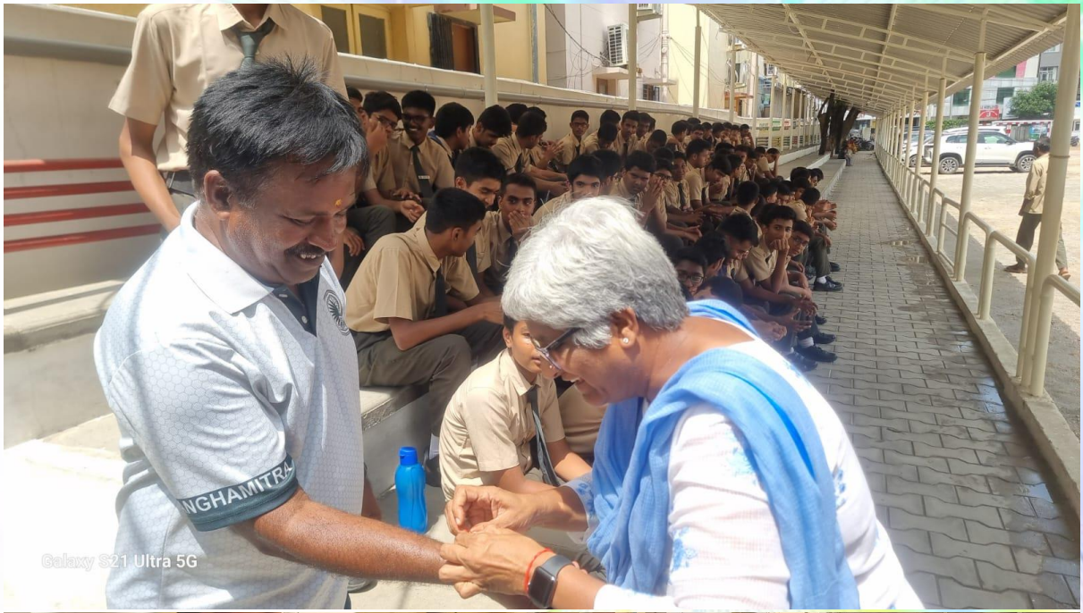
Galaxy S21 Ultra 5G