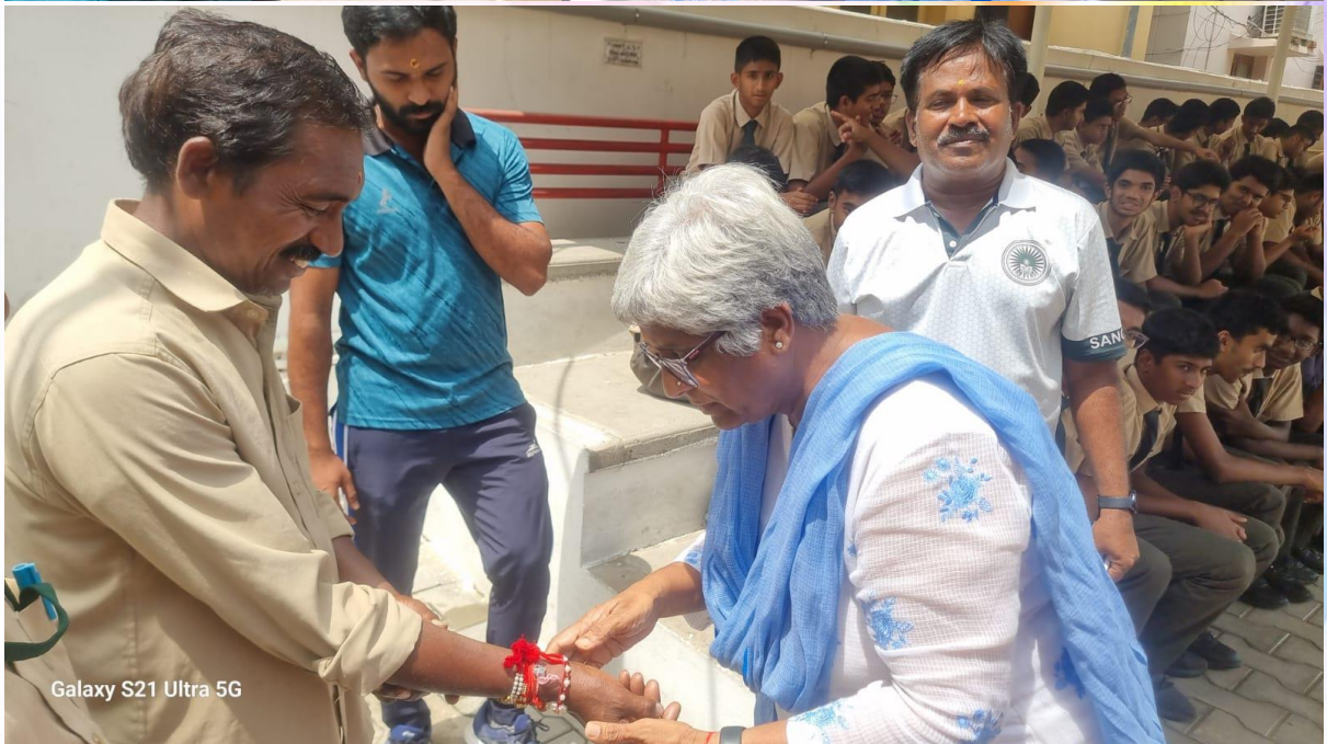
Galaxy S21 Ultra 5G