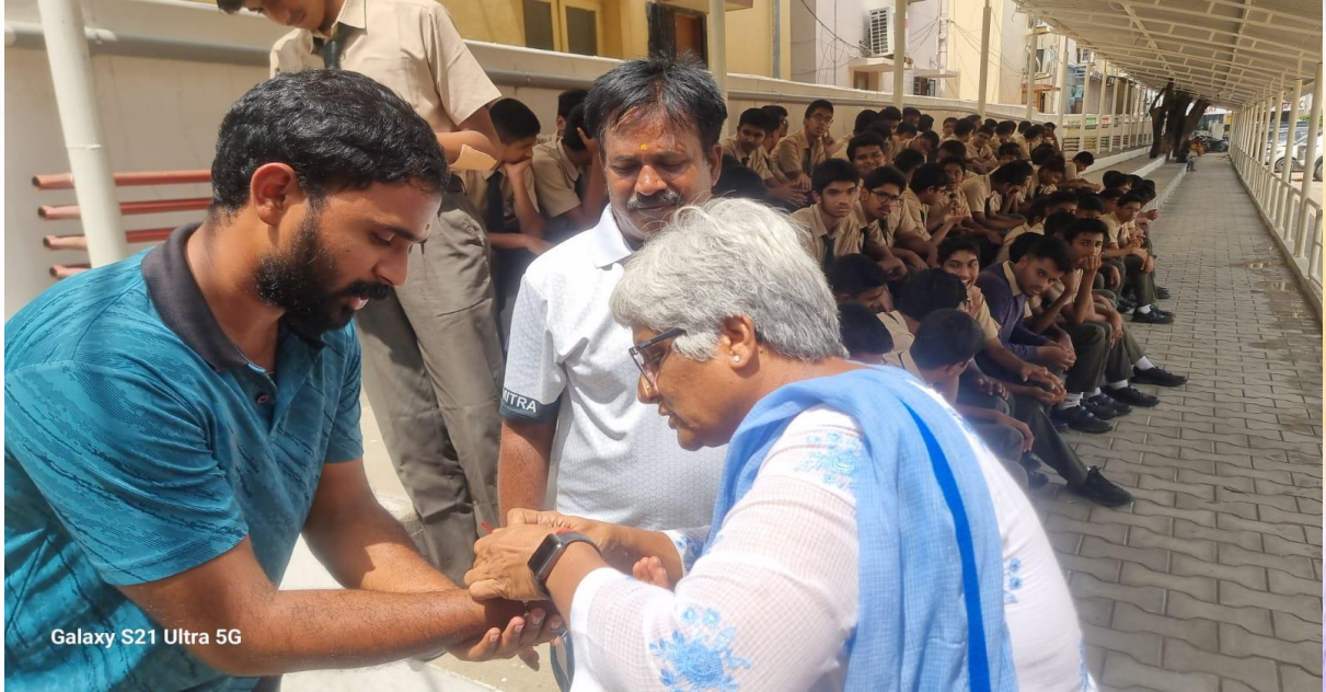
Galaxy S21 Ultra 5G